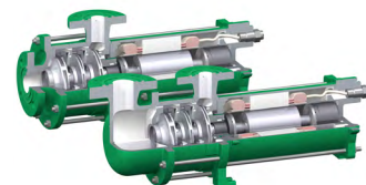
CAM / CAMR